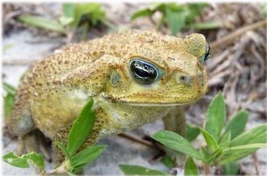
Cane Toad

BACKGROUND: Cane toads appear everywhere from the Keys all the way up to Lake Okeechobee. Nearly a century ago this species was first introduced to Florida by the sugar cane industry to control harmful crop pests. Unfortunately, the toads have increased in numbers and in habitat over decades due in part to pet trade escapes and intentional releases. One of the largest toad species in the world, cane toads are about 6" long at maturity, although a few can grow to an impressive 10"! However, according to the Florida Fish and Wildlife Commission, cane toads pose a relatively low threat to Florida's ecosystem.