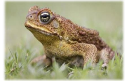
Cane Toad

CANE TOAD ARRIVAL: At certain times each year cane toads ( Rhinella marina ), known also as bufo toads , will appear in our residential communities. Cane toads are most active in the early evening and at night. We know the toads have arrived when we hear their mating calls. The male toads attract females with a low-pitched, consistent warbling sound that is lovely and quite difficult to ignore!